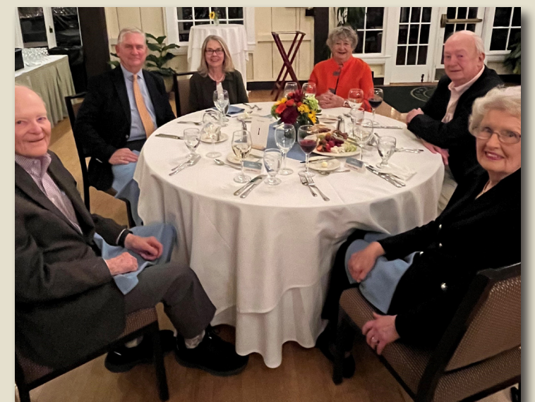
Louise's Table dinner attendees