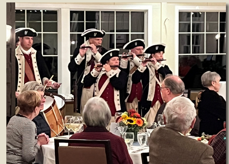
Fife and drum corps